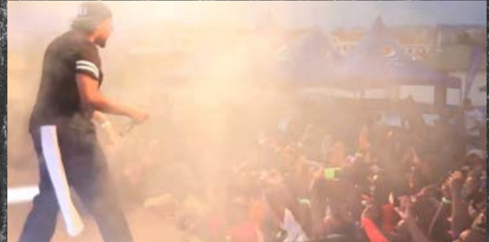
NAVIO CONCERT 2014: RAW SNIPPETS