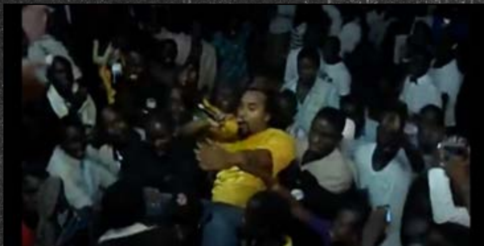
NAVIO CROWD SURFS IN ARUA: NEW YEARS