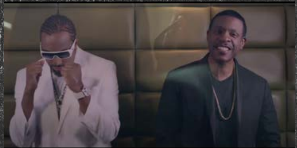
ON AND ON (FT. KEITH SWEAT)