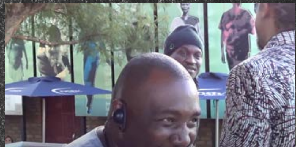
NAVIO AT THE CHANNEL O AWARDS 2013- BEHIND THE SCENES WITH PSQUARED AND MORE!