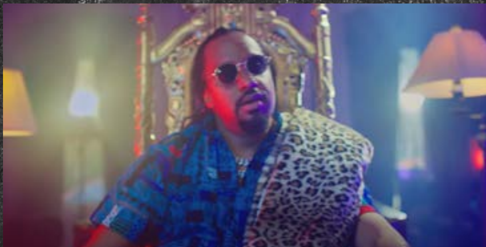
WATER FT TYRA CHANTEY