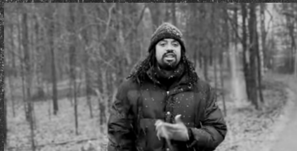
ENO CYPHER NAVIO VERSE