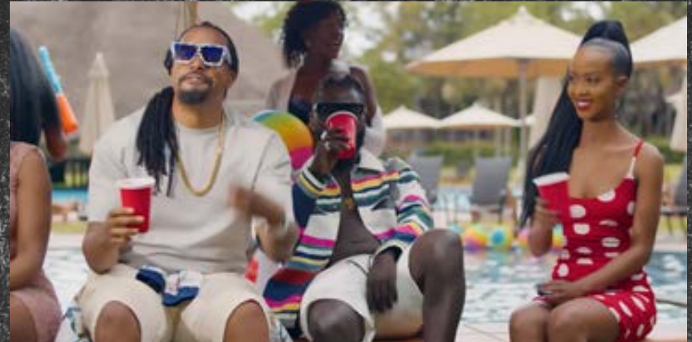
LETS DO IT (TUKOLEELE) FT NVIIRI THE STORYTELLER