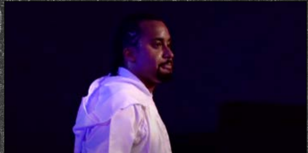
NAVIO PERFORMING LIVE IN CONCERT: NEKOLEERA: GYANGE