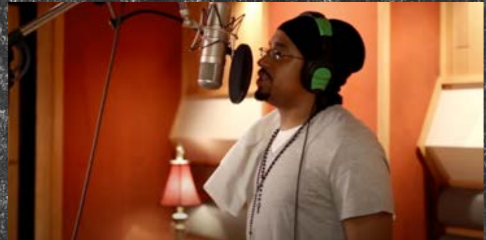
NAVIO DOCUMENTARY 2014- PART 1