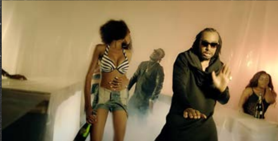
GBESILE FT BURNA BOY