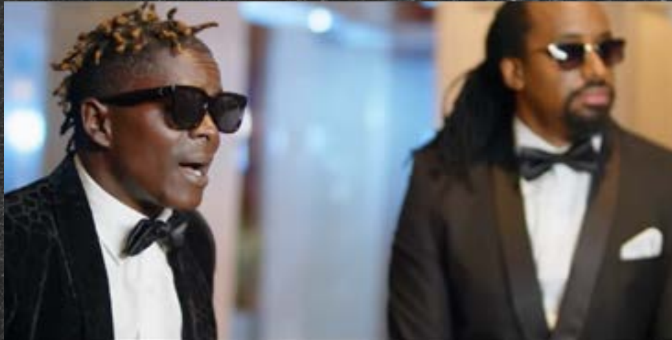
NKWAGALA OMU FT KING SAHA