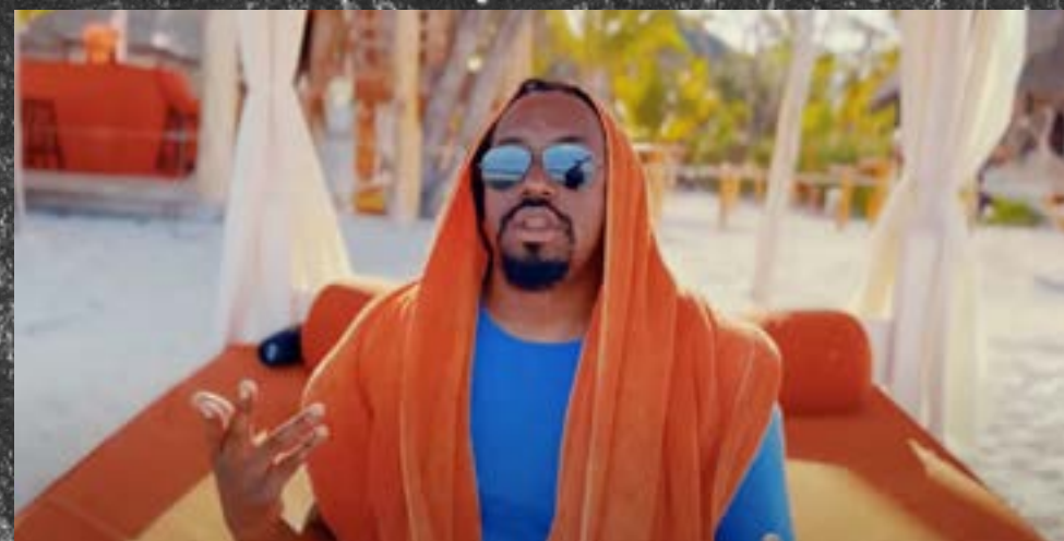
SUNSET DRIFT FT AKEINE